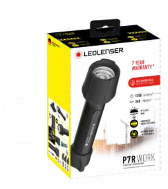
Exemplary Packaging Illustration